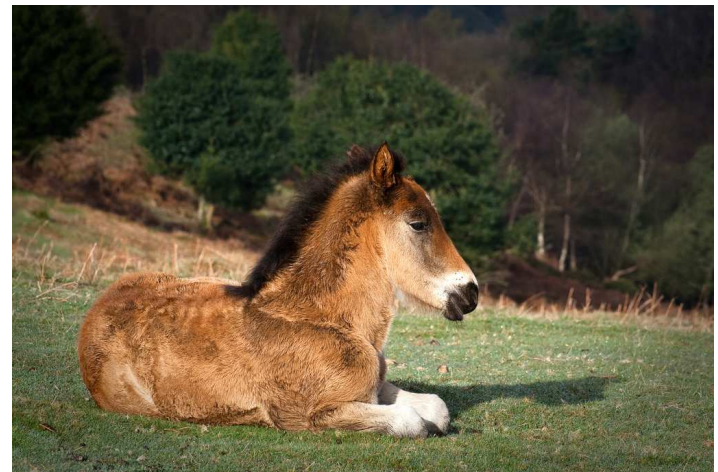
A Youngster on the Quantocks