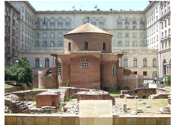
Ротонда Свети Георги, София

The formatted documentation must seem simple to end users.