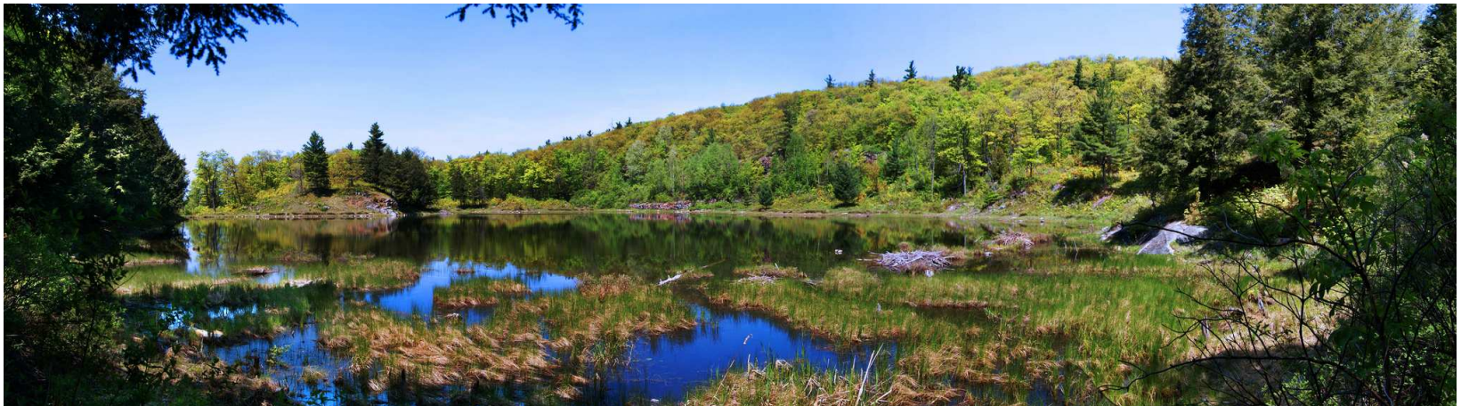
Black Lake near King Mountain, Gatineau Park, Quebec, Canada

http://mdocml.bsd.lv/press.html has all the slides of these talks