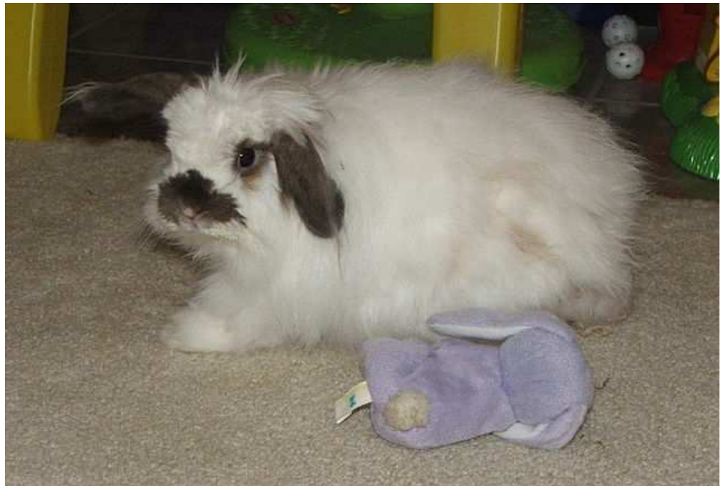
American Fuzzy Lop

For mandoc, full functional coverage requires running afl continuously for several days on modern PC hardware.