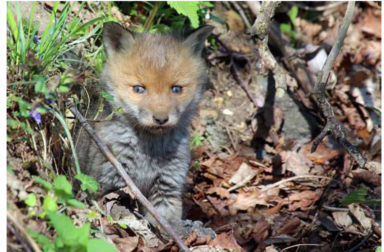
Red fox kit ( Vulpes vulpes )