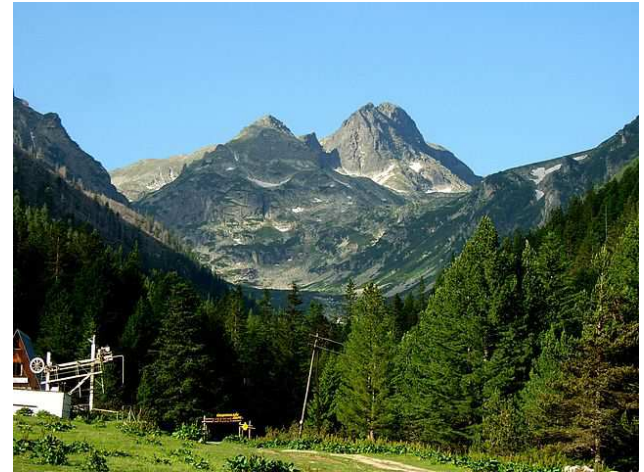
Мальовица 2729м, Рила, Bulgaria