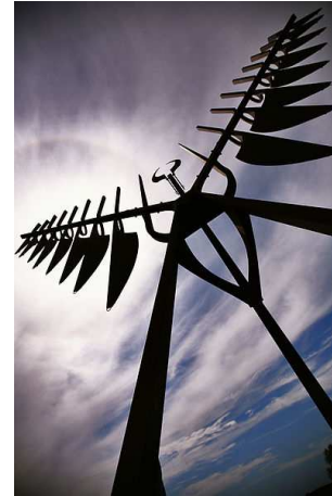
Spiritcatcher by Ron Baird (1986) in Barrie