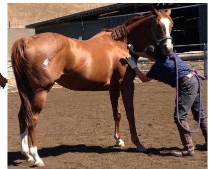
“Bedifferent” © 2013 Cynthia Livingston