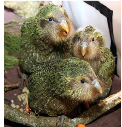
Kakapo chicks (Strigops habroptilus)