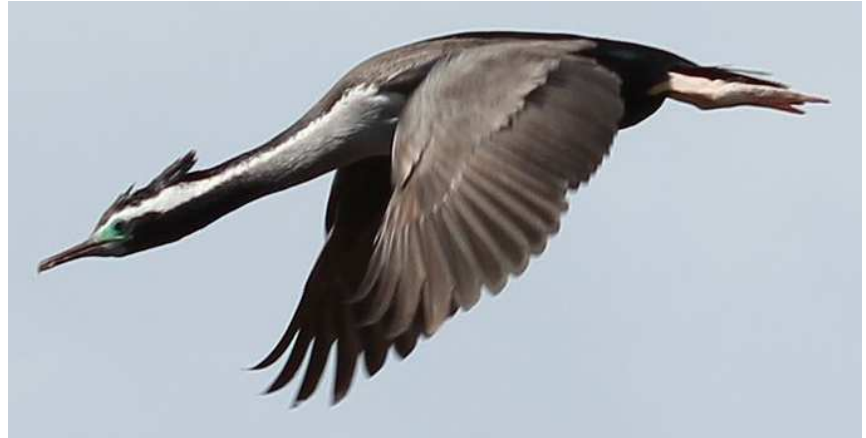
Spotted Shag / Parekareka ( Phalacrocorax punctatus )