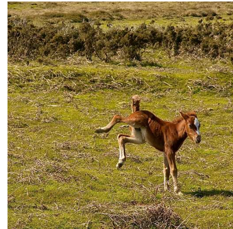
Foals Just Wanna Have Fun