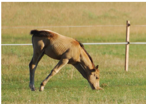
Csikó — Foal

mandoc: becoming the main BSD manual toolbox BSDCan 2015