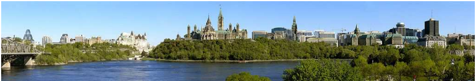
Ottawa (Ontario) seen from Gatineau (Quebec)

Debian, SUSE, Redhat and derivatives; IBM AIX, Cygwin