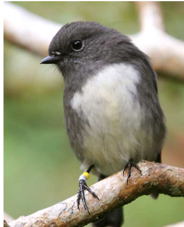
Robin / Toutouwai ( Petroica australis )

for porting mandoc(1) to Non-BSD systems and providing feedback