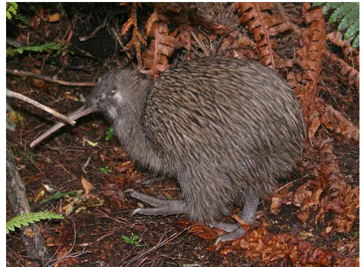
Southern Kiwi / Tokoeka ( Apteryx australis )