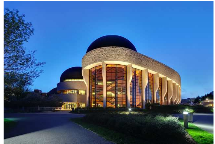
Canadian Museum of History, Gatineau