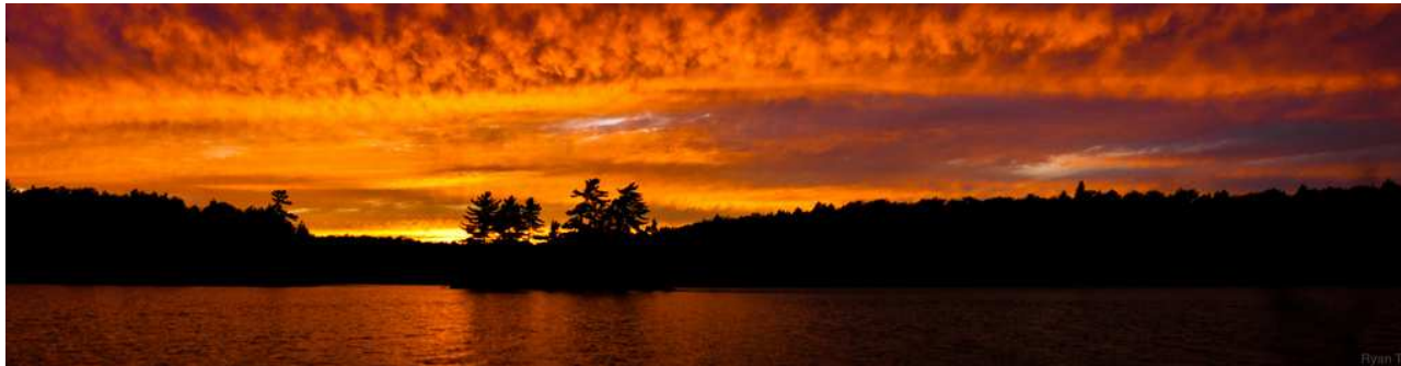
Maggie Lake Algonquin Park Ontario, Canada