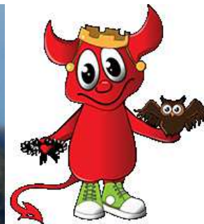
София © 2014 Алица Димитрова