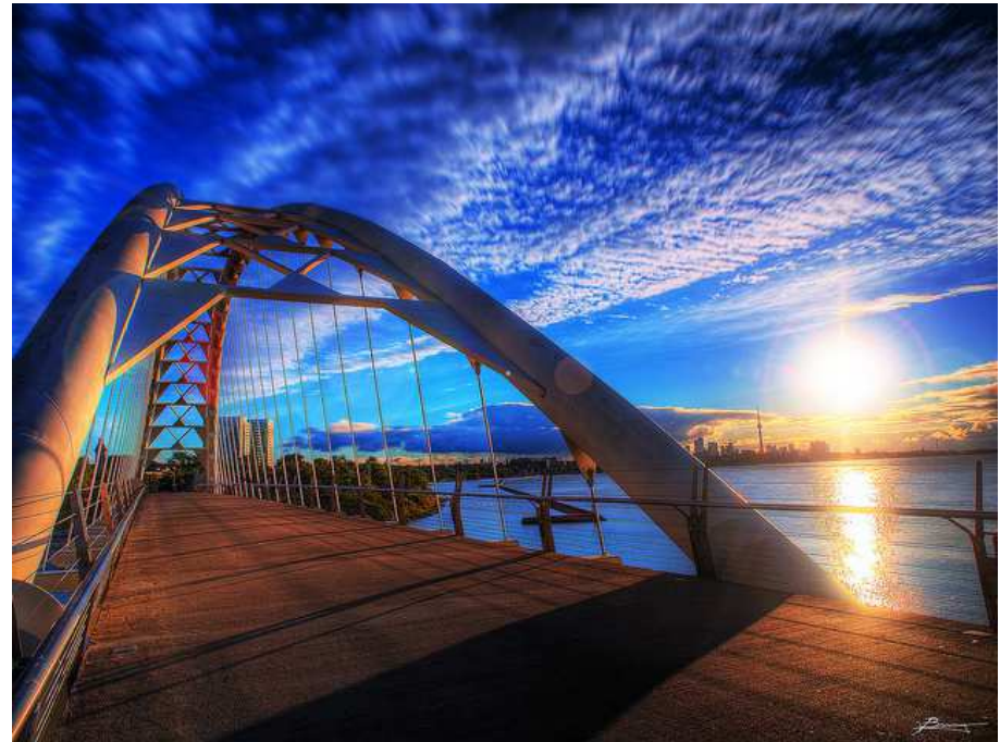
Humber Bay Bridge, Toronto

and manual maintenance of the USE_GROFF variable.