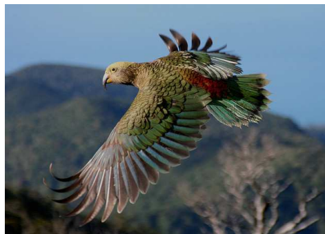
Kea juvenile