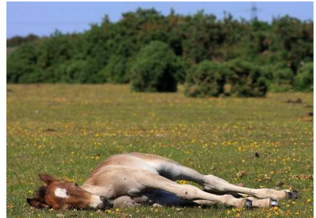
New Forest Foal