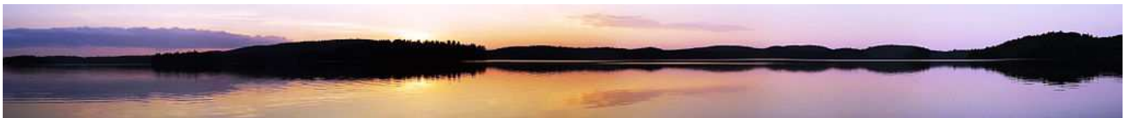
North Tea Lake, Algonquin Provincial Park