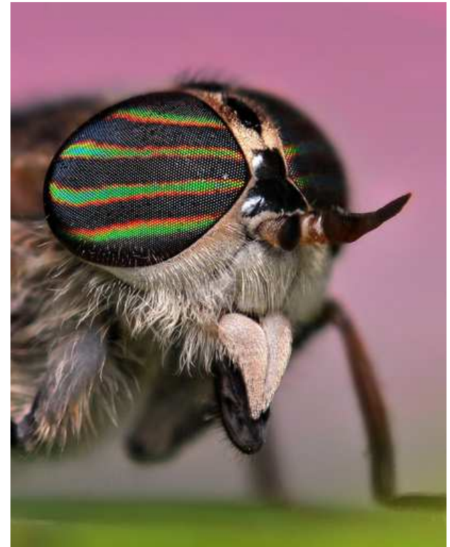
Horse Fly Portrait

Users don't remember and don't use them.