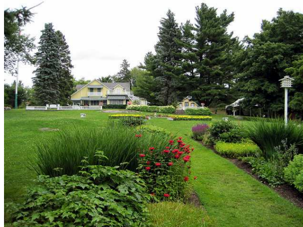
Moorside Cottage, Mackenzie King Estate, Gatineau Park