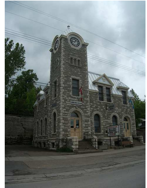
Bonnechere Museum, Eganville