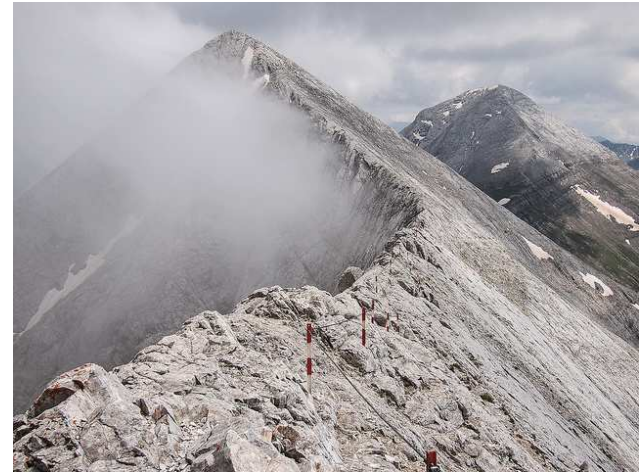
Кутело 2908м и Вихрен 2914м, Пирин

One simple, versatile language: mdoc(7) — with a long tradition: